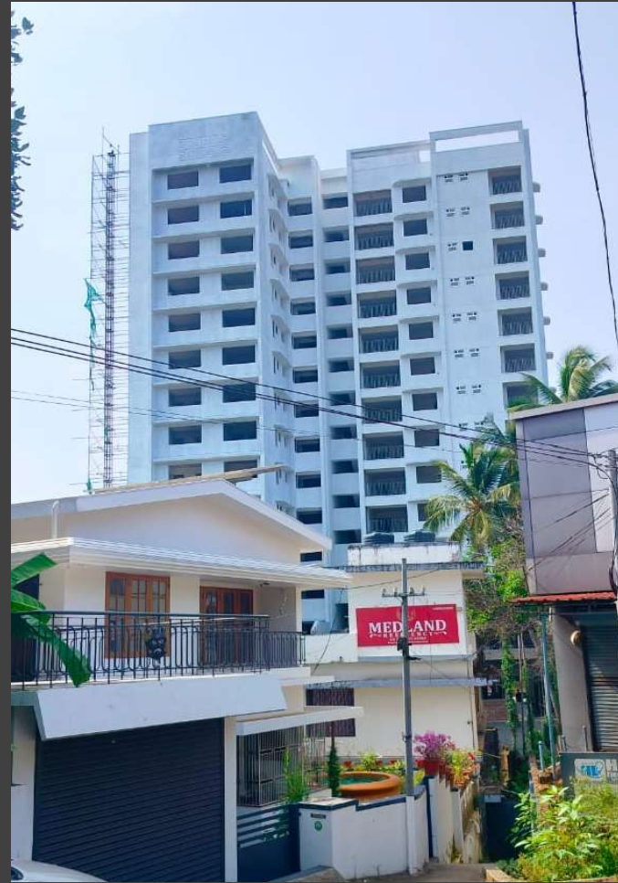
North West & South Elevation