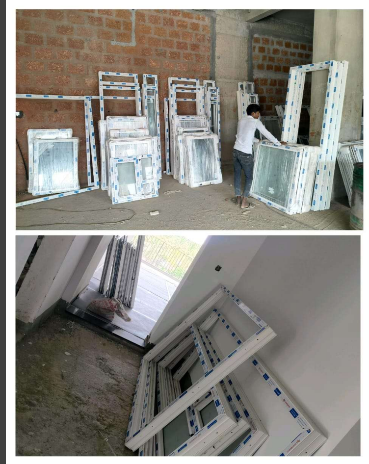
UPVC window frame work