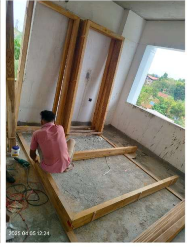
Joint filling & floor protection