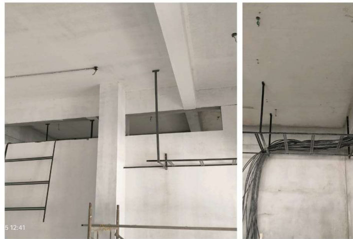
HT electrical work