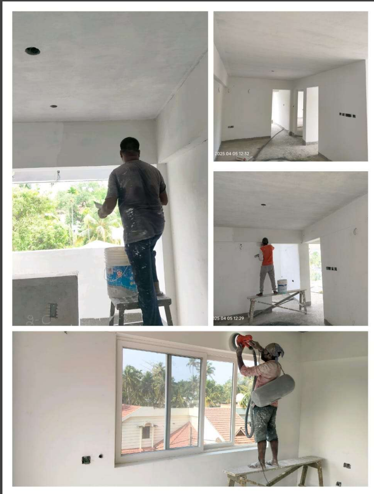
Apartment putty works