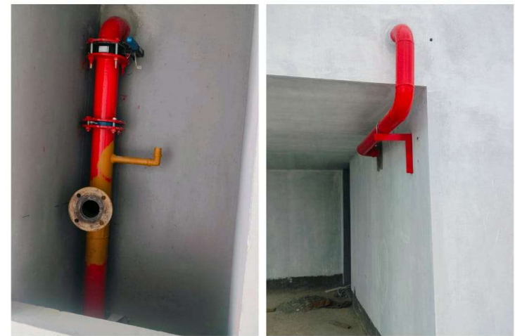
Fire fighting work