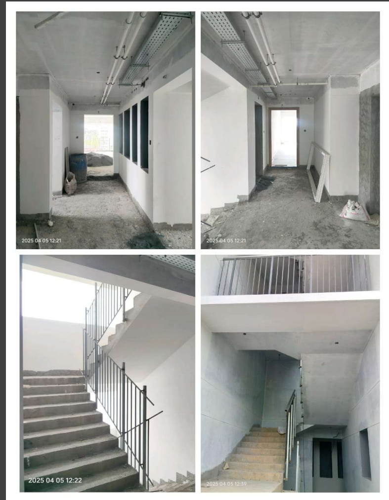
Passage and Staircase putty & primer work